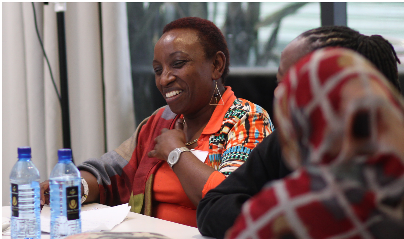
Civil society representatives met in Nairobi, Kenya, for a regional review meeting to discuss their experiences of INGO transitions. September 2019